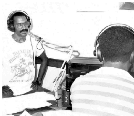
So much has happened on the Jamaican media landscape over the past 81 years. Media liberalisation has resulted in a vast increase in radio stations. FILE

One exception is seen with a newscast in Jamaican and English called 'braadkyas 'Jamekan', on NewsTalk 93 FM. This is not